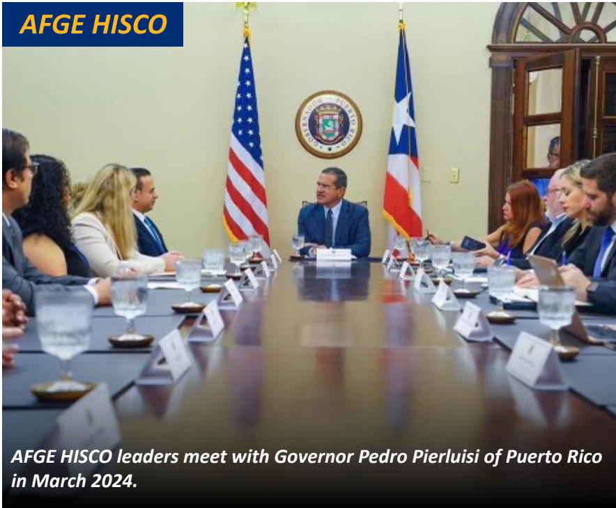
AFGE HISCO leaders meet with Governor Pedro Pierluisi of Puerto Rico in March 2024.