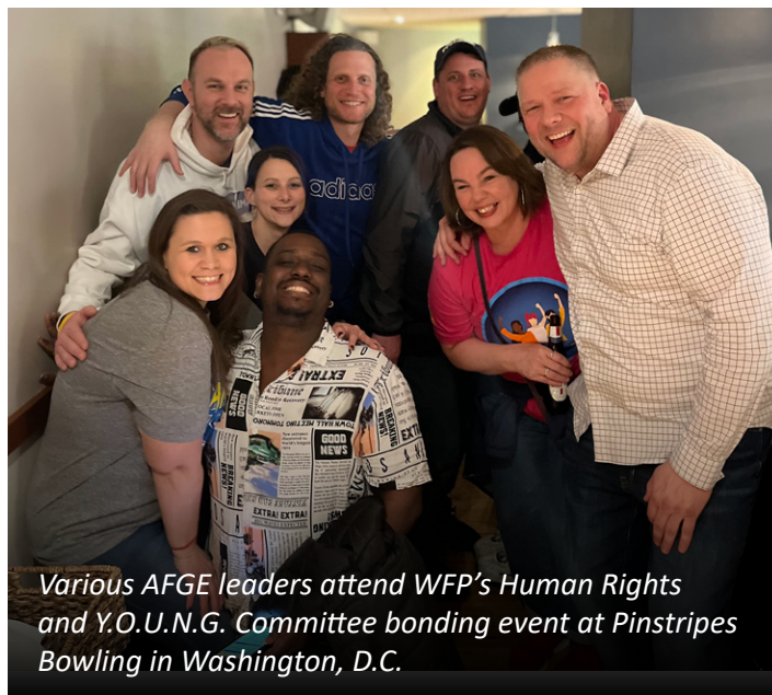
Various AFGE leaders attend WFP's Human Rights and Y.O.U.N.G. Committee bonding event at Pinstripes Bowling in Washington, D.C.

In February 2024, just before AFGE's Legislative Conference, the National Human Rights Committee met at the AFGE Headquarters for a 2-day meeting session. They worked diligently to prepare for Women's History Month, AFGE's National Convention, and more events across the country. They set a