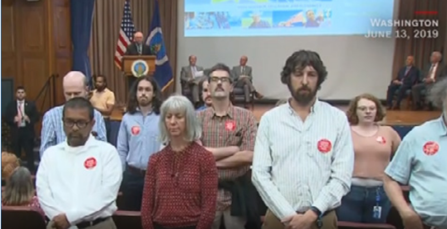
Workers turn their backs on USDA Secretary Sonny Perdue as he announces relocation

hen the Trump administration proposed relocating employees at two small but critical USDA agencies from the nation's capital, workers responded the best way possible: by using their collective voice to demand a seat at the table.