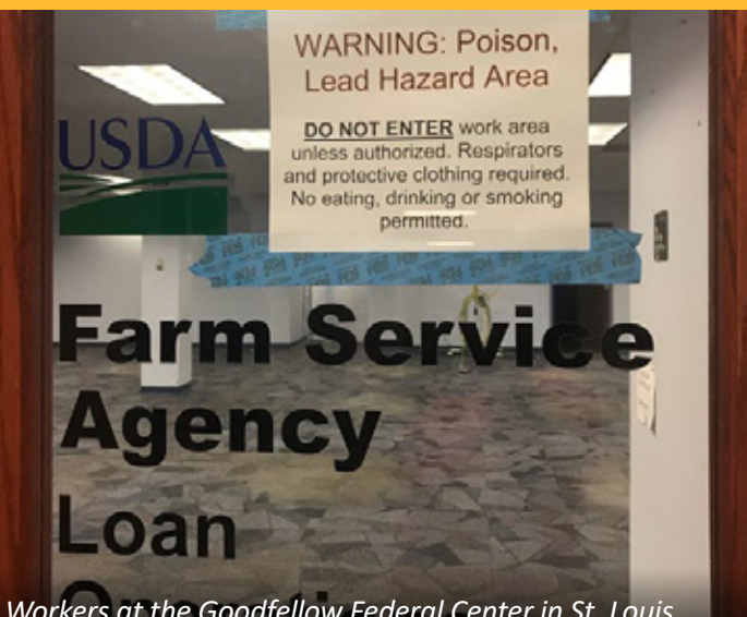
Workers at the Goodfellow Federal Center in St. Louis, Mo., were exposed to environmental hazards for decades

Our collective efforts to shine a spotlight on the dangerous working conditions garnered extensive media coverage and prompted GSA to clean up its act.