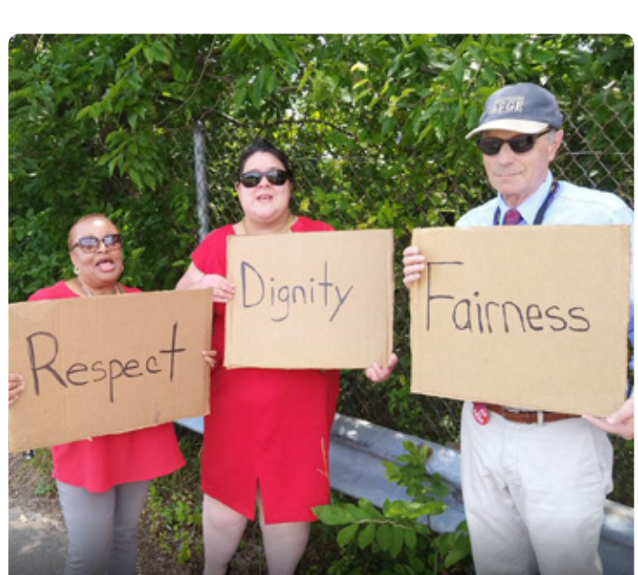
Members of AFGE Local 2328 protest outside the Hampton VA Medical Center in June