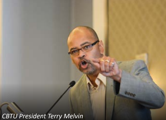
speaks at Diversity Week. Pho