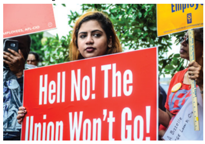
Thousands rallied at the Red for Feds Day of Action.