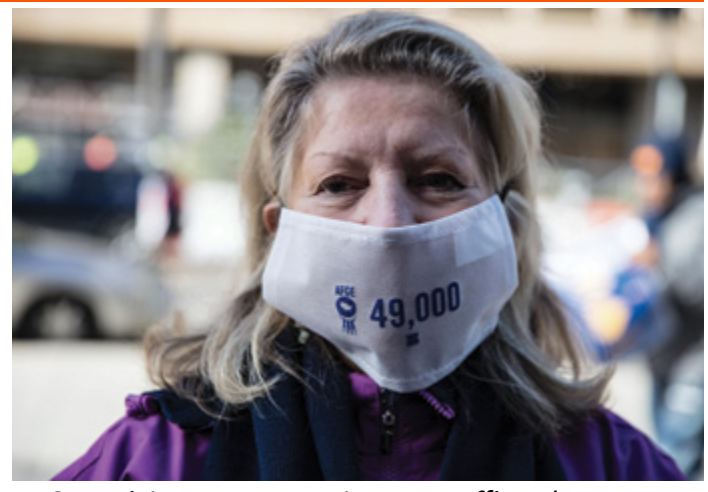
AFGE activist protests against VA staffing shortages.