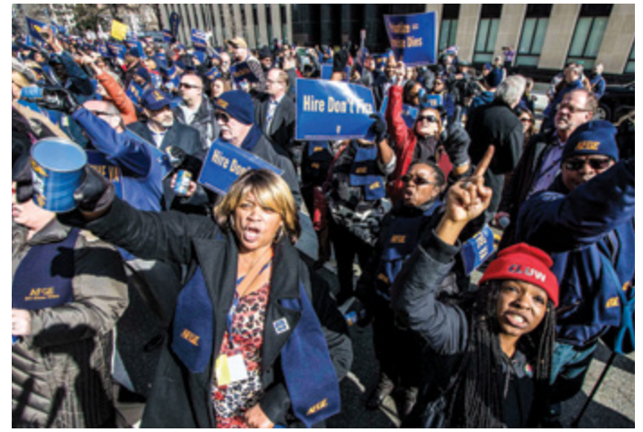
Members rally in front of the VA.