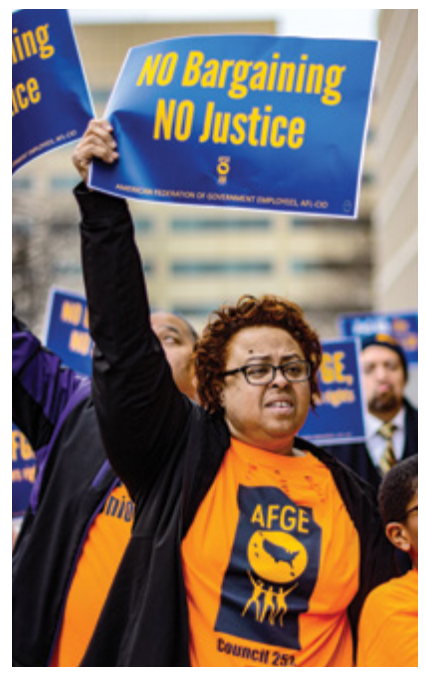
A stand against Department of Education illegal edicts.