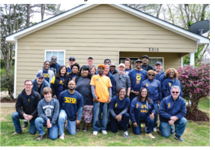
AFGE members volunteer for Habitat for Humanity.