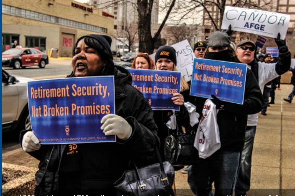
AFGE activists and TSOs rally against pay and retirement cuts near Washington, D.C.

Find out if you are already registered or how to register for the first time at Vote411.org .