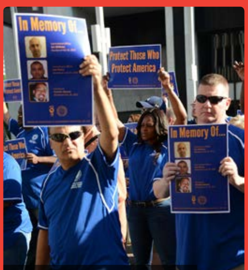
CPL members honored their fallen brothers at a Memphis, Tn vigil

But we can only accomplish these goals if we elect the right people. With strong