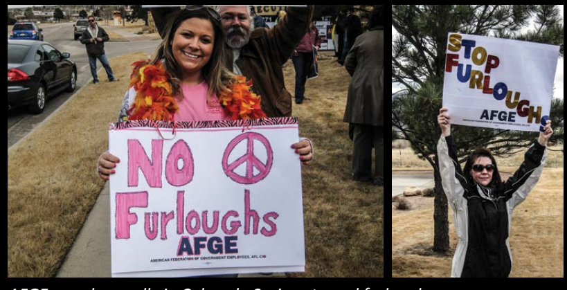
AFGE members rally in Colorado Springs to end furloughs

To learn more about what's being done in this critical fight for federal employees, log on to www.AFGE.org and click on the red stop sign.