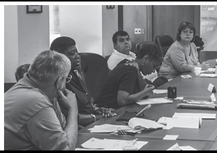
Highlights from the 2002 Leadership Meeting in Chicago